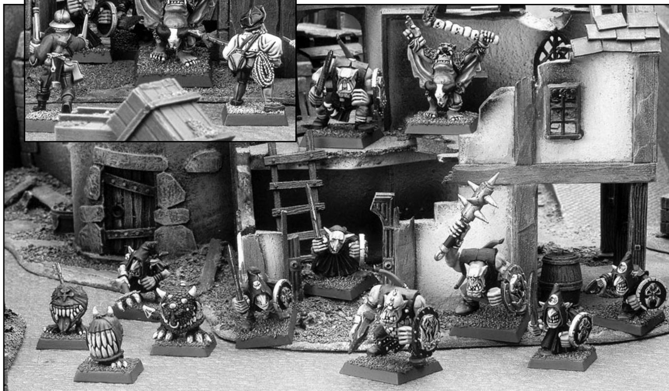
Thogskin leads his warband in search of booty and a big scrap.